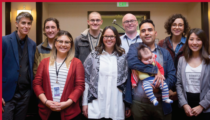
UPEP volunteers and the Executive Director of the Laughing Gull Foundation attending the 2018 National Conference on Higher Education in Prison in Indianapolis.

I had a dream, that one day I would be seated at your table, with those candle sticks, a centerpiece. Feasting on the broth of humanity. We will eat from the same bowl.